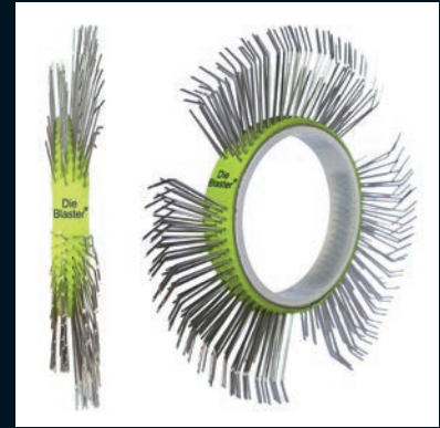
Die Blaster® Belt, Stainless Steel, 11 mm, Left