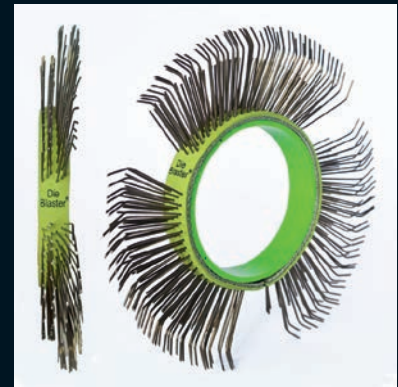
Die Blaster® Belt, Carbon Steel, 11 mm, Left