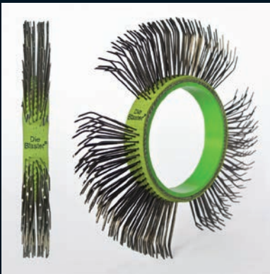
Die Blaster® Belt, Carbon Steel, 11 mm