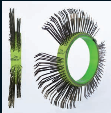
Die Blaster® Belt, Carbon Steel, 11 mm, Right