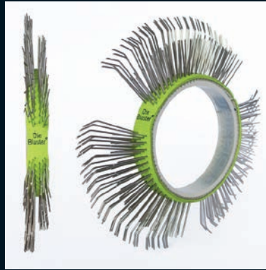
Die Blaster® Belt, Stainless Steel, 11 mm, Right